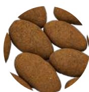
almonds in milk chocolate with cinnamon