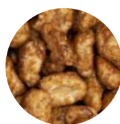
peanuts in caramel with cinnamon