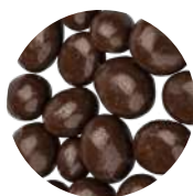
dried cranberries in dark chocolate