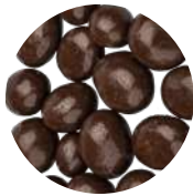
gooseberries in dark chocolate