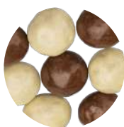
gingerbread cookies in milk, dessert and white chocolate