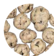
black currants in white chocolate