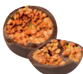
milk chocolate with freeze-dried fruits