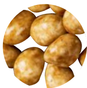
rum raisins in white chocolate