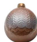
Milk chocolate praline filled with orange peel and cloves