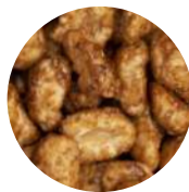
peanuts in caramel and cinnamon