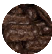
orange peel in dark chocolate