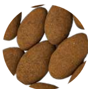
almonds in milk chocolate with cinnamon