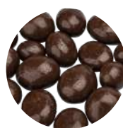
gooseberries in dark chocolate