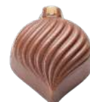
Milk chocolate praline filled with dried plums