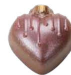
Milk chocolate praline with gingerbread spices filling